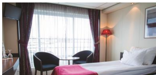
Juliette Balcony Room Strauss Deck

Our journey on the River Danube ends at the western county line of Romania's picturesque Constanta County, Hirsova . We may have free time to explore this charming town (dependent on flight return times - to be advised), before we say goodbye to your luxury river cruise ship and fly back to England, with memories of a wonderful tour.