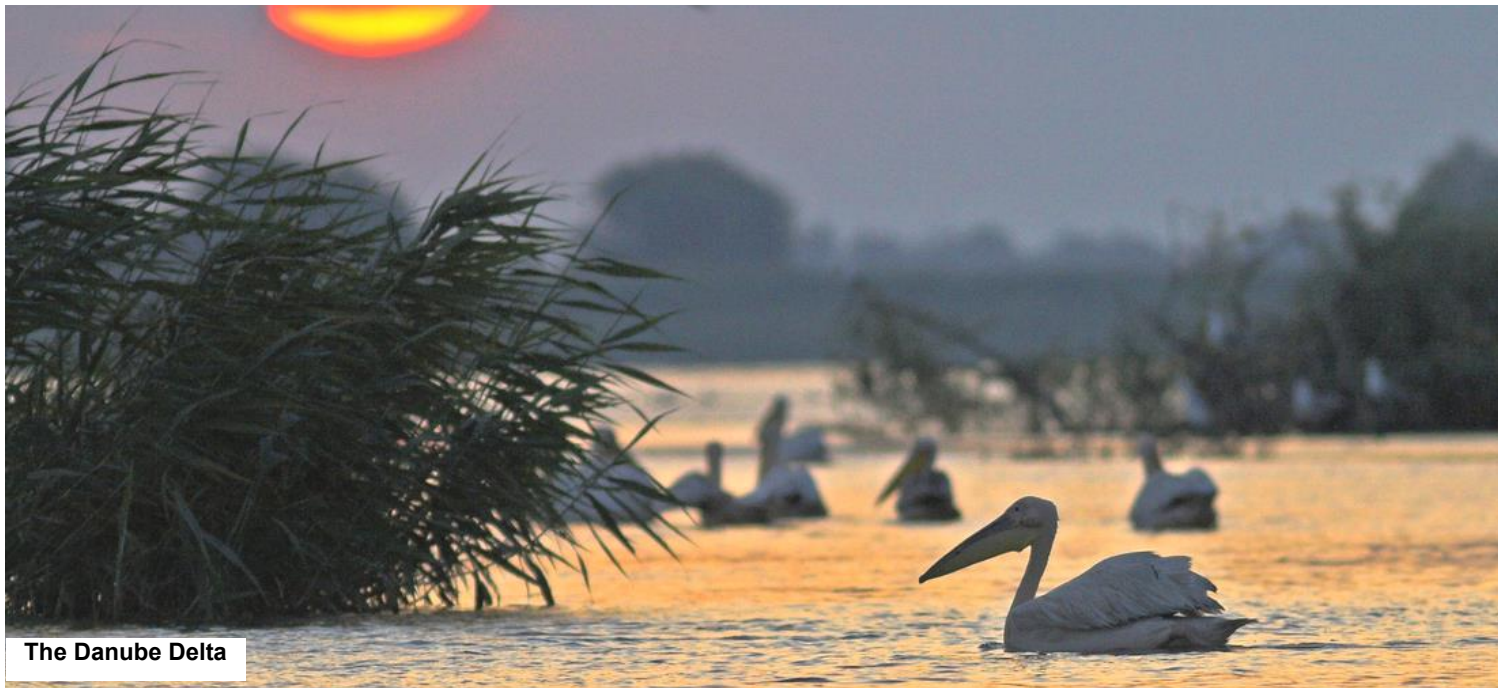
The Danube Delta